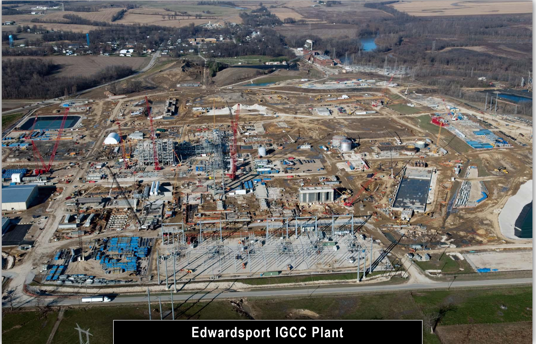
Edwardsport IGCC Plant www.duke-energy.com